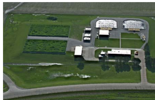
WWTP during flood conditions (photo taken prior to 1995 construction)