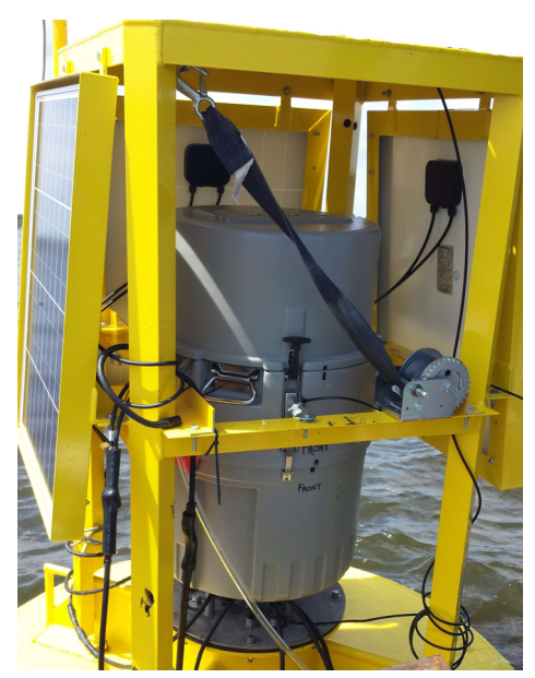
Sampler on buoy with solar panels

According to Miller, the sampler and buoy were a perfect pairing for this study. Even though the buoy wobbled back and forth in strong waves, samples remained in their bottles. The sequenced program took enough samples so the team could get an adequate amount of samples per day for their project, but only visit the buoy once per week to retrieve samples. This time frame was neces-