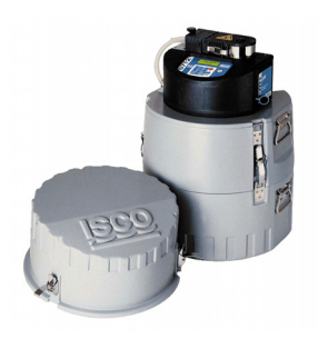
6712 Portable Sampler

The Teledyne Isco 6712 portable sampler was used to monitor not only the production of the blue-green algal in Lake Winnebago, but also any algae toxins that could contaminate the surrounding community's drinking water.