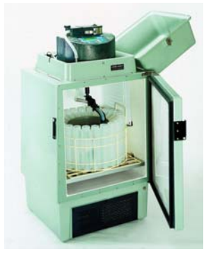
6712 FR refrigerated sampler