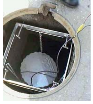
6712 Full-size sampler installation in manhole