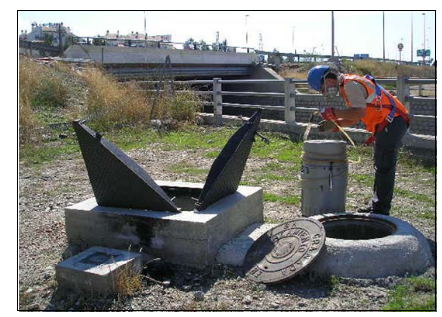
Full-size portable sampler at a remote site

A 6712 full-size automatic sampler from Teledyne Isco, Inc. is at the heart of portable systems that remotely monitor water quality from industrial sites in Granada, Spain.