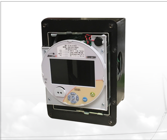
Example of a JEMStar II retrofitting a GE DS63 using an existing 'short' enclosure.