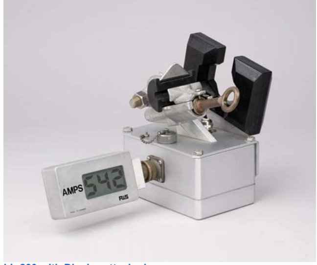
LL-230 with Display attached