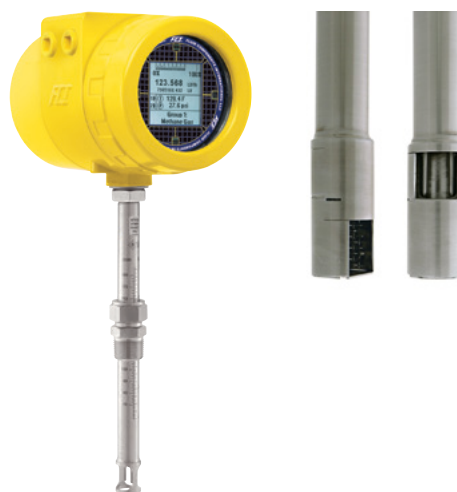
Figure 4: ST80 flow meter; Wet Gas MASSter flow sensor

totalized flow, alarms, diagnostics feedback and a user defined label field is also available. Technicians can easily spot check flow data in person for reliability.