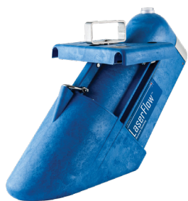
LaserFlow® velocity sensor