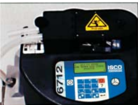
Automatic wastewater sampler with a pump revolution counting system and liquid presence detector to deliver repeatable sample volumes.

The official publication on sampling [1] advises selection of a sample pump "capable of lifting a sample a vertical distance of 6.1 m and maintaining a