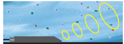
TIENet 350 Doppler AV operation

The 350 is a smart sensor with built-in digital electronics, with all depth and velocity signals processed within the sensor itself. The sensor stores its own temperature and pressure calibration data for the entire measurement span (0-3 m) internally, eliminating temperature drift, providing long-term stability, and eliminating the need for span recalibration. This makes the sensor ideal for stormwater applications with extended dry periods. Velocity quality and diagnostic data can be logged for every reading, providing data verification, as well as excellent real-time evaluation of site conditions during installation or post-analysis.