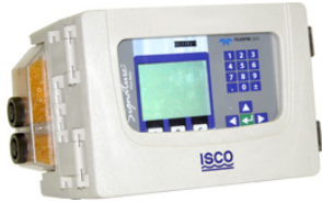
Signature Flow Meter