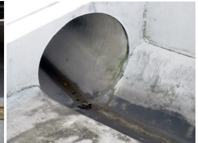
Stormwater pipe to be monitored & Signature Flow Meter