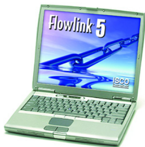
Flowlink 5.1 Software