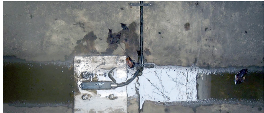
TIENet 350 AV sensor Mounted in stormwater pipe

The Signature Flow Meter provides a powerful and flexible system with multiple smart sensor interfaces and multi-parameter options. The enclosure is weather resistant (IP66) even if the protective front cover is opened. Data and reports can easily be retrieved through a USB interface, and a unique verification tool ensures the integrity of all logged data.